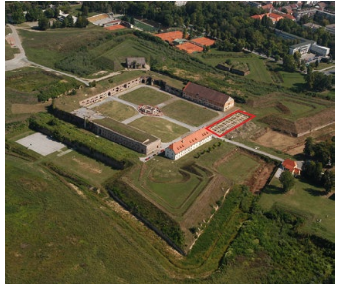
Fortification Brod with the foundation of the future hotel

The hotel will contain 32 rooms with 58 beds and 4 apartments with 8 beds. During the construction of the hotel, the investor will have to comply with the conservatory requirements.