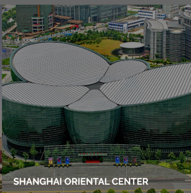
SHANGHAI ORIENTAL CENTER